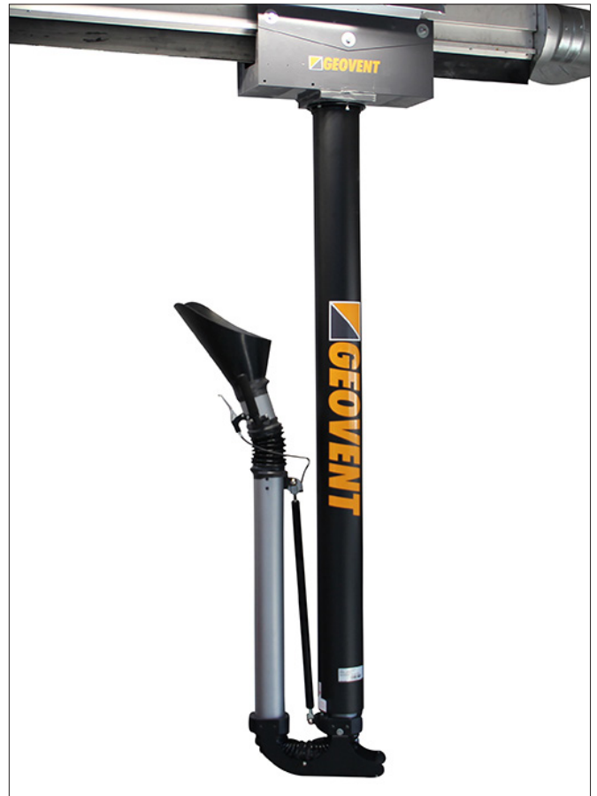
Smart Exhaust Arm